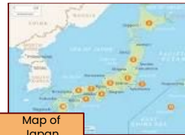
Map of Japan