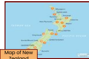
Map of New Zealand