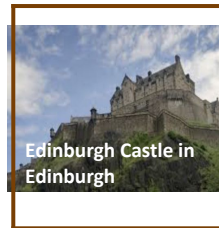
Edinburgh Castle in Edinburgh